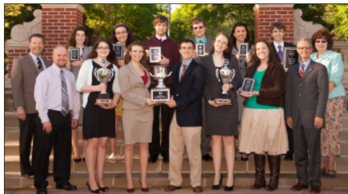
Speech and Debate Team members brought home several awards after the National Forensics Association Championship Tournament in Athens, Ohio.