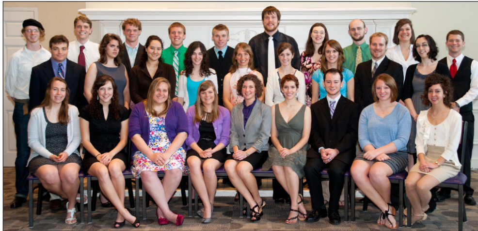
Phi Beta Kappa's newest members pose in the Student Union Building for their induction April 15.