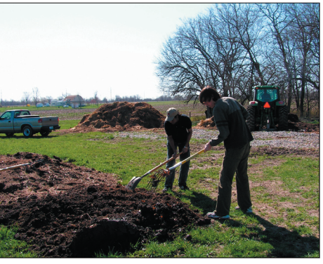
Students mix the accumulated "pre-compost" at the University Farm recently.

The next step in the process is transporting the food waste to the University Farm, using a truck which was purchased with funds from the original grant. The waste is picked up and transported daily, to be dumped on a concrete mixing pad at the Farm. Horse stable bedding (fine wood chips and horse manure) from the Farm, as well as grass clippings, leaves or straw from the campus grounds are added to the food to increase the carbon: nitrogen ratio in the material to be composted; this promotes and favors the appropriate microbes who do the