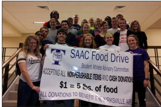
The Student Athlete Advisory Committee (SAAC) has surpassed last year's food drive collection by 500 lbs. Shown is SAAC with a poster for their annual food drive.

SAAC will resume the food drive next semester with collections at men's and women's basketball, softball, baseball and other spring sport events. All donations will be split between the Kirksville Salvation Army and the Christian Community Food Depot.